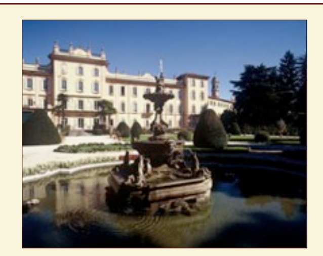
Villa Recalcati - VARESE

Via Albani - 21100 Varese. It is a de-iced arena. The floor size will be full use of the ice