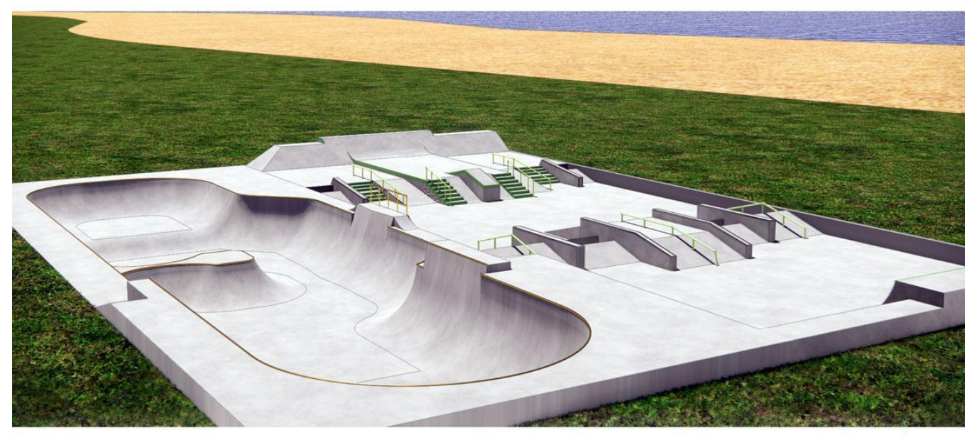
COSTA VERDE SKATEPARK, LIMA - PERÙ