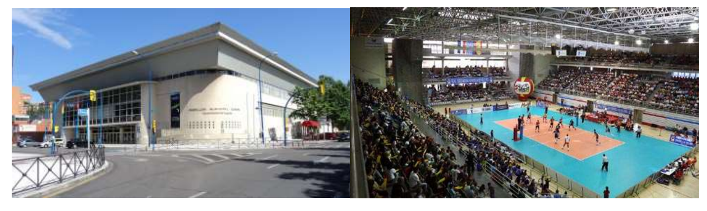
Facilities of Pabellón Europa

"...estimated attendance of the event is around 2000 people amoung skaters, technicians, fans, federative teams, sponsors..."