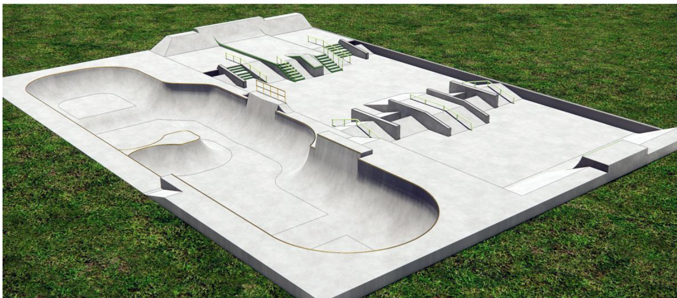
COSTA VERDE SKATEPARK, LIMA - PERÙ