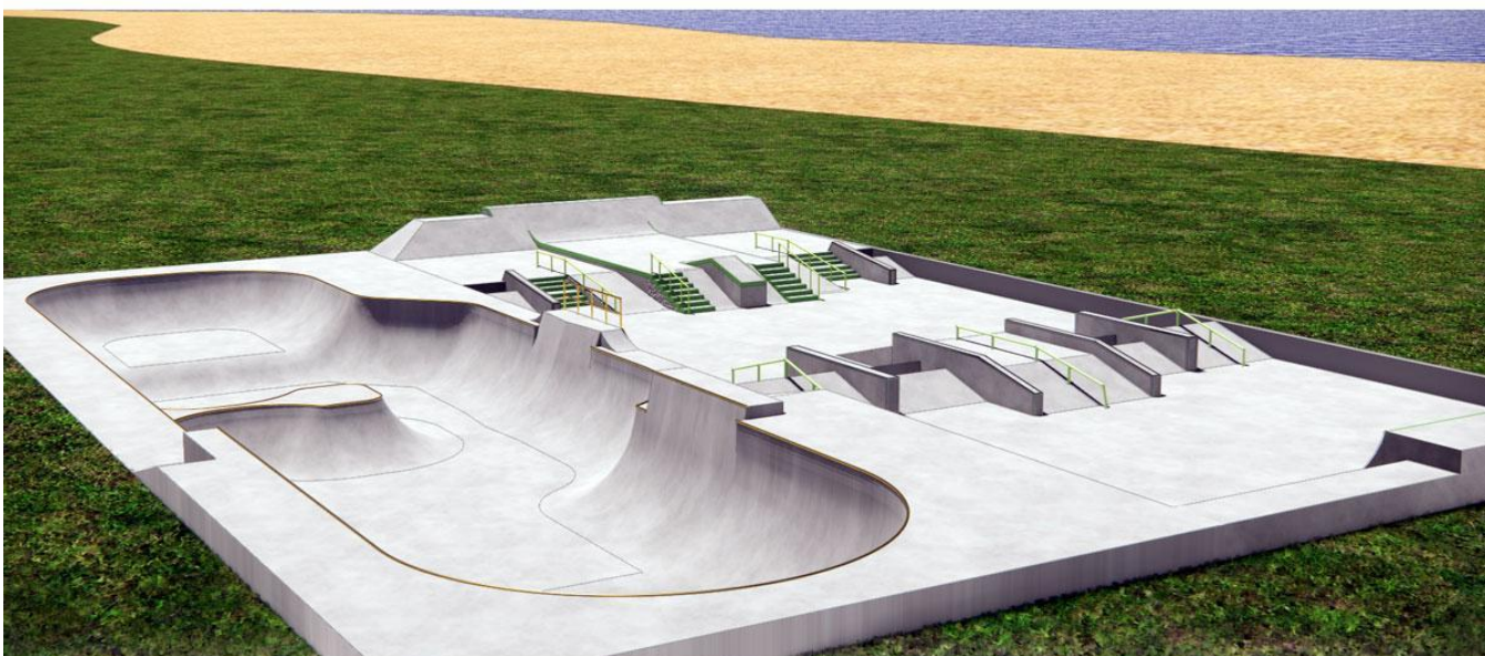
COSTA VERDE SKATEPARK, LIMA - PERÙ